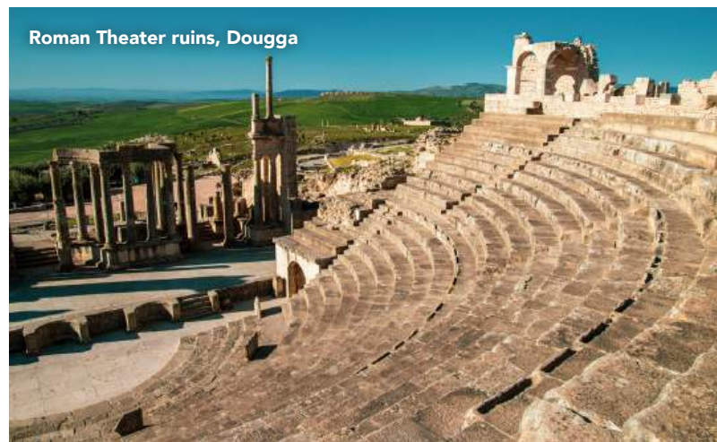
Roman Theater ruins, Dougga

After enjoying lunch at a local restaurant, join your knowledgeable guide for a tour of Carthage's Roman villas , featuring exquisite mosaics that reflect the luxurious lifestyle of the Roman elite. Visit the impressive Antonine Baths , constructed in the second century A.D. during Emperor Antoninus Pius's reign, recognized as the largest Roman baths outside Italy.