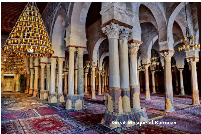
Great Mosque of Kairouan

After enjoying a lunch of local Tunisian cuisine, visit the El Jem Museum , renowned for its extensive collection of Roman mosaics, sculptures, pottery, and jewelry. A standout exhibit is the African House , a meticulously restored Roman villa featuring its original mosaics.