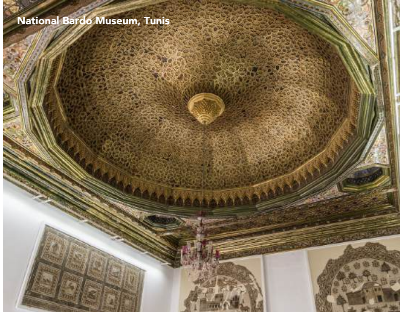
National Bardo Museum, Tunis

With an expert guide, traverse Kerkouane's streets and defensive walls laid out over 2,600 years ago, examining remarkably well-preserved ruins unearthed since the city's rediscovery in 1952, including the Mediterranean region's earliest known private baths .